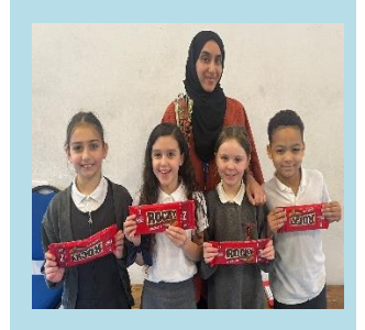
KS2 Attendance winners: 4 Red 99%