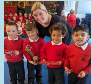
EYFS & KS1 Attendance winners: Reception Green 97%